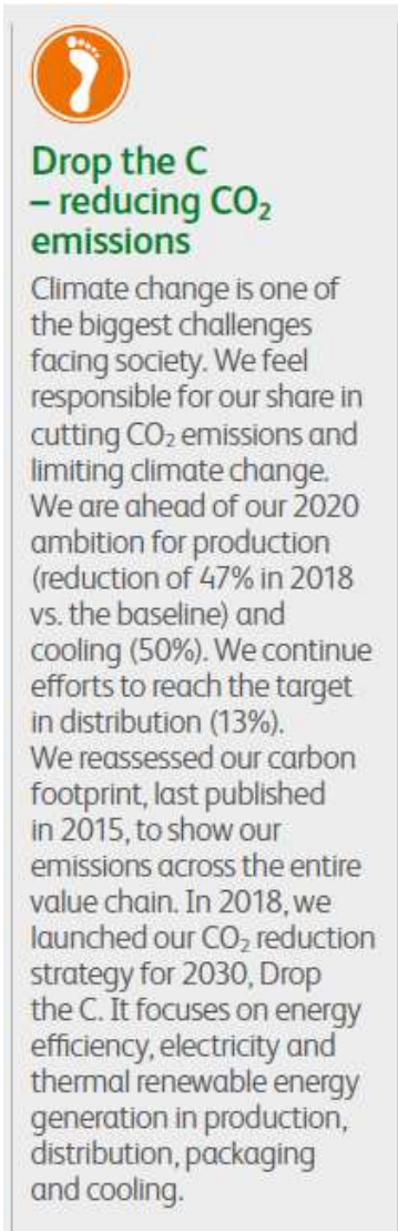
Figure 5 – Good practice: distinction between short-, medium- and long-term value creation (2018 annual reporting of Heineken N.V. pages 120-121 and 125)