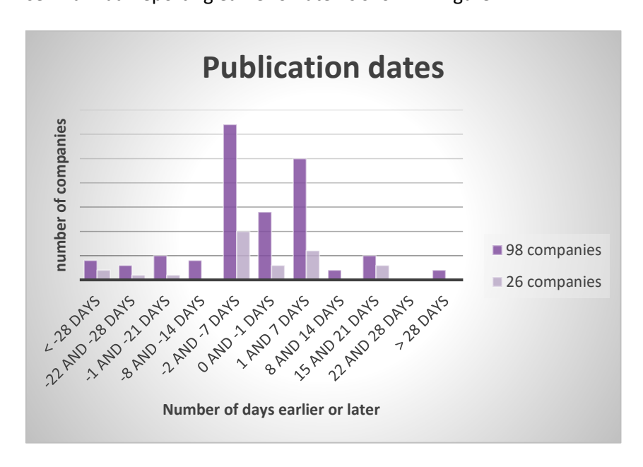
Figure 2: Distribution of publication dates in 2020 compared to 2019

Our review shows that on average, companies published their 2020 semi-annual reports a couple of days earlier. This applies to both the entire population and the 26 companies we selected. It should also be noted that there were significant outliers of more than 40 days in both directions (reporting earlier or later). The distribution of the number of companies publishing their 2020 semi-annual reporting earlier or later is shown in figure 2.