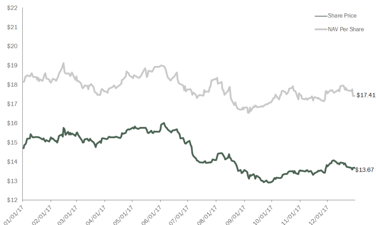
PSH NAV vs. Trading Price (January 1, 2017 – December 31, 2017)

PSH shares continued to trade at a significant discount to NAV during 2017. The Board took several steps to address the discount during the year. On May 2, 2017, PSH's Public Shares commenced trading on the Premium Segment of the Main Market of the LSE. In July of 2017, PSH was included in the FTSE All-Share and FTSE 250 indices. We believe that approximately 6% of shares outstanding were acquired by index funds at that time. Contemporaneously with the listing, the Company launched a share buyback program for up to approximately 5% of PSH's outstanding shares. From the inception of the buyback program on May 2, 2017 to date, PSH invested $77.2 million to purchase 5,474,173 public shares at an average discount of 20.1% and has remaining capacity under the current buyback program to purchase an additional 6,525,827 of public shares. In November 2017, PSH announced that it amended the terms of the share buyback program to permit share purchases on Euronext Amsterdam, alongside the LSE. This has enabled PSH to greatly increase the pace of the buyback.