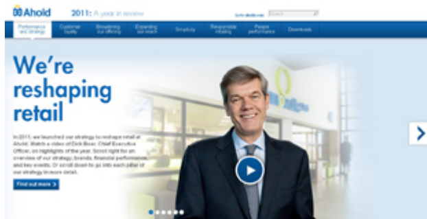
Click on the image above to access the review site

Follow this link ( https://www.ahold.com/web/show#!/web/Ahold/Our-2011-Reports-are-now-available.htm ) to get access to all downloads, documents and videos.