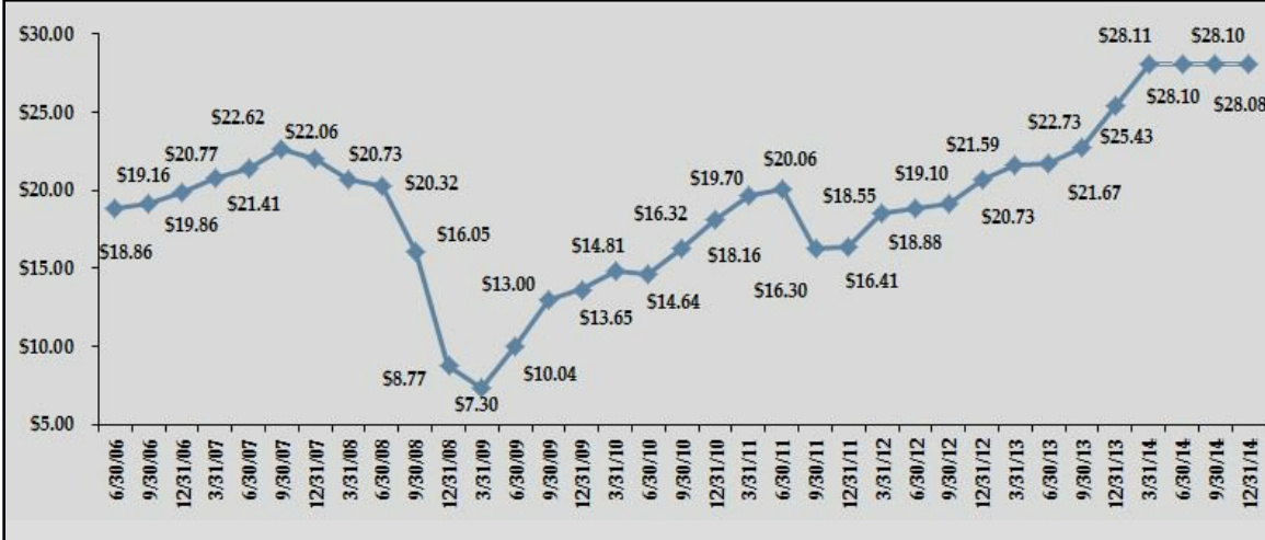
Figure 1: Net Asset Value per Unit

As of December 31, 2014, the net asset value of AP Alternative Assets was approximately $2,143.5 million, or $28.08 per common unit. This reflects a net increase in net assets after contributions, distributions and unit purchases of approximately $202.3 million, or $2.65 per common unit during the year ended December 31, 2014.