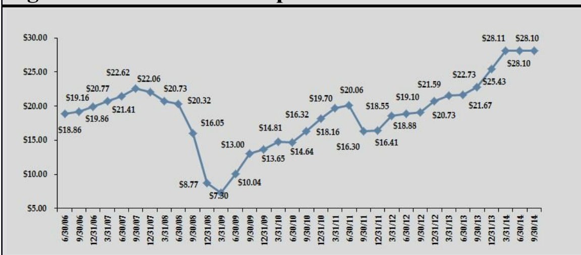
Figure 1: Net Asset Value per Unit

As of September 30, 2014, the net asset value of AP Alternative Assets was approximately $2,144.5 million, or $28.10 per common unit. This reflects a net decrease in net assets after contributions, distributions and unit purchases of approximately $0.4 million, or $0.00 per common unit during the three months ended September 30, 2014.