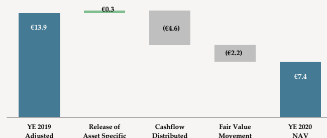
Italian RE funds – FY 2020 Adjusted NAV Bridge (€ million)

Following adoption of the Realisation Plan, the Company plans to continue to hold and realise these assets in accordance with existing business plans. It will support these investments to the extent required to optimise returns and distribute cash to shareholders when available.